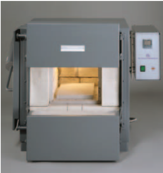
Type F1700 with CP53600