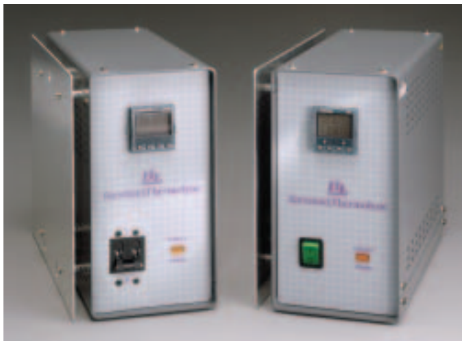
Type CP53600 & Type CP53700