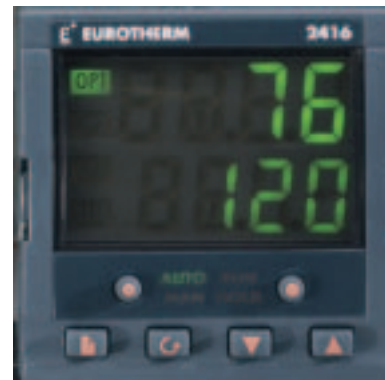
Group C1 and D1